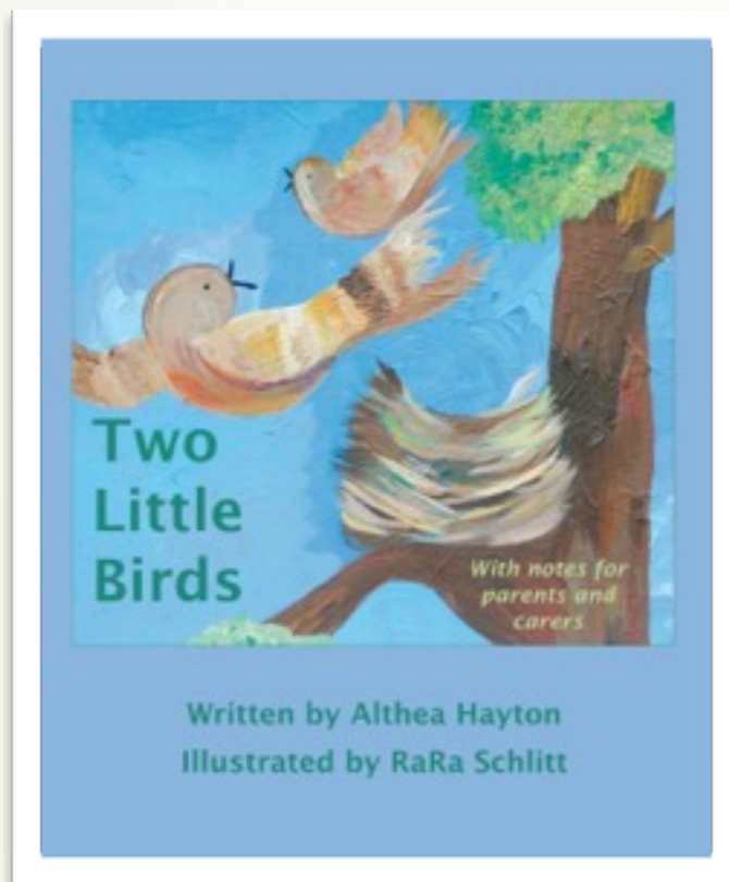
Aged 0-7 (Illustrated paperback book)

For details, downloads and orders, visit www.wombtwinkids.co.uk