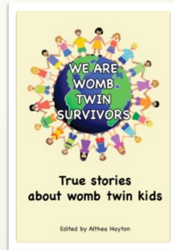
Aged 6-12 (Printable A4 PDF download)